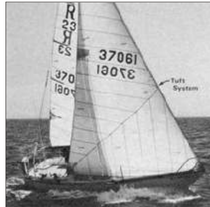
Figure 1. Mainsail and genoa set up for telltales and tufts.

On my boat, the crew uses a complete set of telltales on both the genoa and the mainsail to achieve total sail trim. But the helmsman steers watching only the tuft system shown in Figure 1. This system consists of a line of four